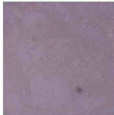
WX-CC-5680 Regal Violet (0.75%, 0.50%, 0.25%)