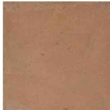
WX-CC-5650 Tangerine Orange (0.75%, 0.50%, 0.25%)