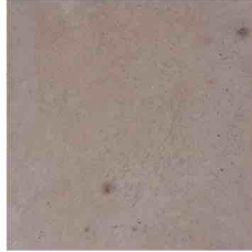
WX-CC-5615 Plum Red (0.75%, 0.50%, 0.25%)