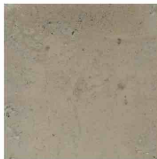
WX-CC-5105 Mustard Yellow (0.75%, 0.50%, 0.25%)