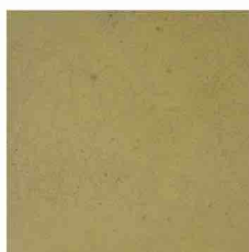
WX-CC-5120 Vegas Yellow (0.75%, 0.50%, 0.25%)