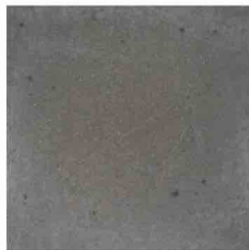
WX-CC-5705 Cosmos Black (0.75%, 0.50%, 0.25%)