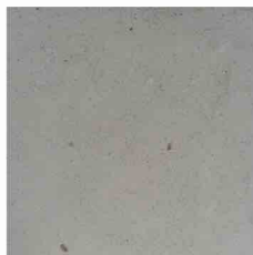
L-R (0.75%) WX-CC-5625 Beet Red WC-CC-5620 Citrus Red WX-CC-5005 Arctic White