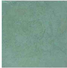
WX-CC-5505 Amazon Green (0.75%, 0.50%, 0.25%)