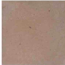
WX-CC-5605 Terracotta Red (0.75%, 0.50%, 0.25%)