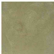
WX-CC-5115 Squash Yellow (0.75%, 0.50%, 0.25%)