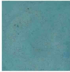
WX-CC-5405 Hawaii Blue (0.75%, 0.50%, 0.25%)