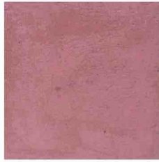
WX-CC-5610 Strawberry Red (0.75%, 0.50%, 0.25%)